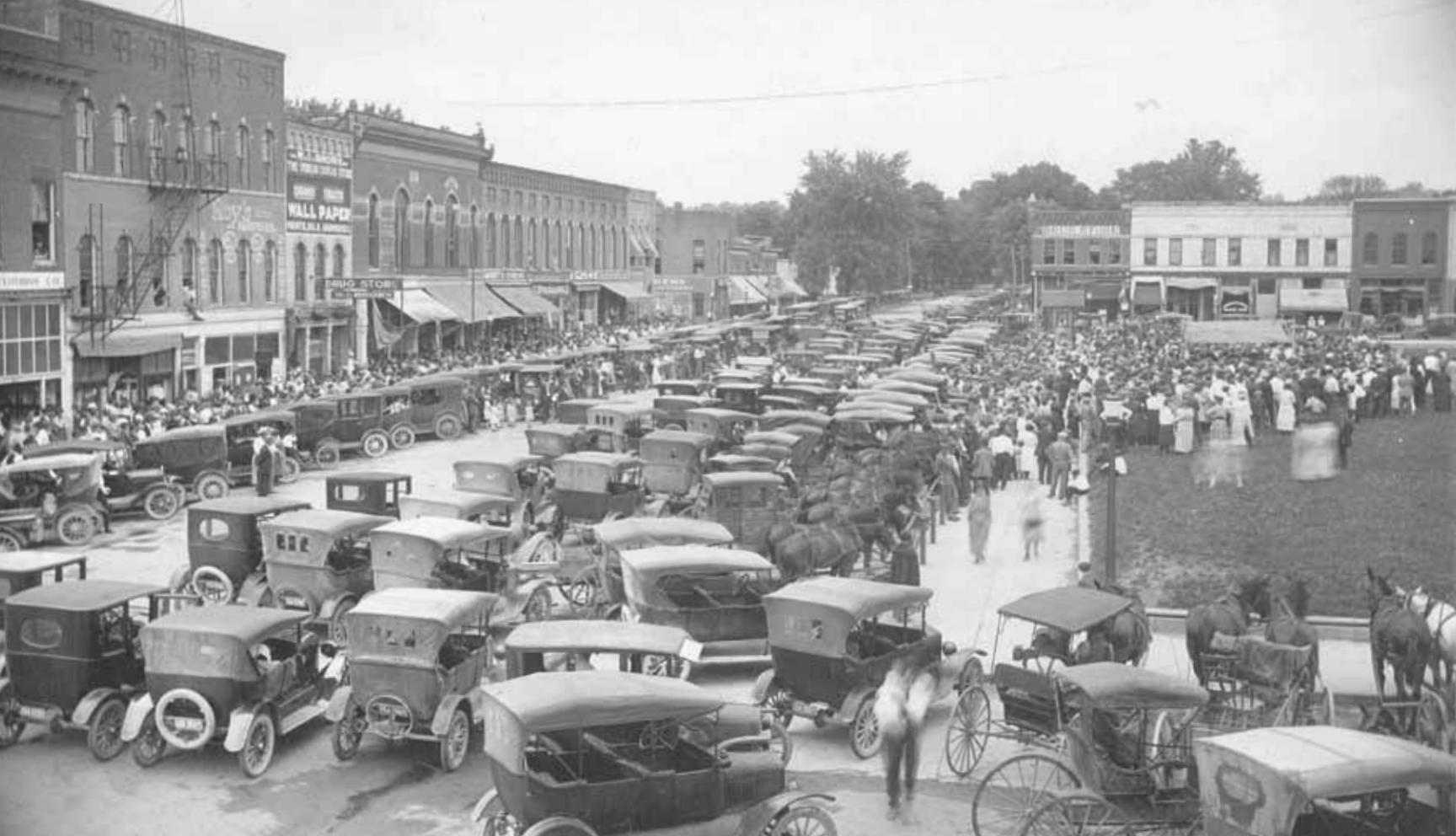
(above) A large crowd gathers at the Spencer town square in this photograph from 1923.